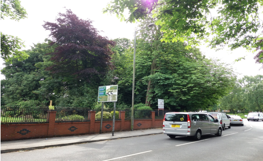
Woodland group adjacent to Brooklands Rd and roundabout

The committee is asked to consider 1 objection made to this order. This relates to a Tree Preservation Order (TPO) served at the above address on 3 Sycamores, 2 Magnolia an Oak and Silver Birch within the front garden and area of adjoining woodland.