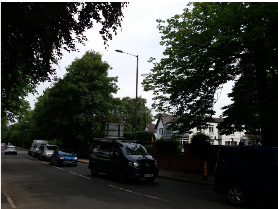
Gap in canopy resulting from recent removals and adjacent trees within garden frontage included within provisional TPO